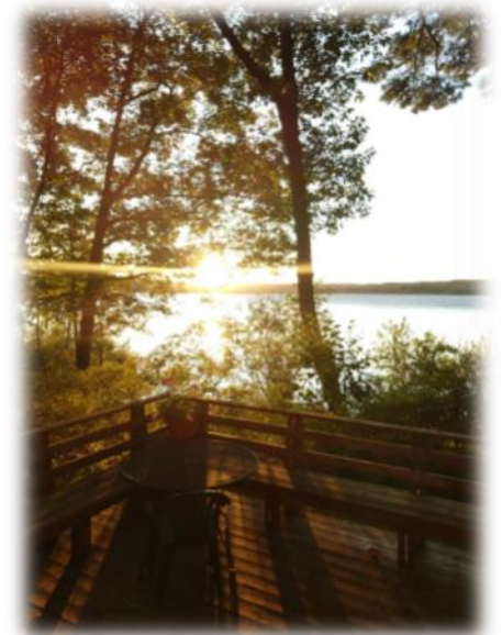
View in the morning off the back porch of the house.