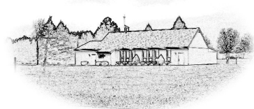
Trinity Lutheran Church 2009