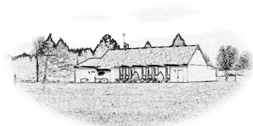
Trinity Lutheran Church 2009